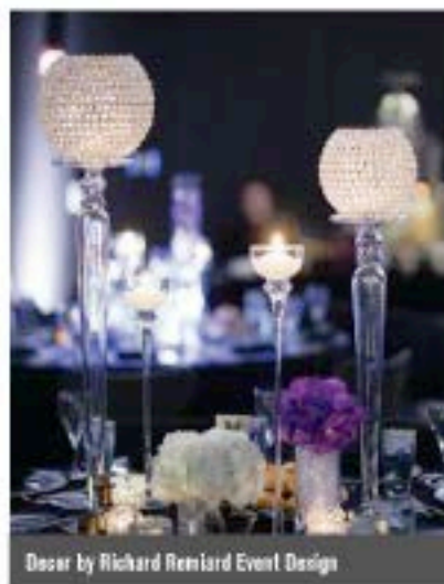
Decor by Richard Remlard Event Design