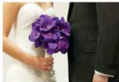
The bride's deep purple bouquet of vanda orchids