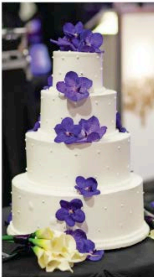
The four-tier chocolate and vanilla-frosted cake was made by Danziger Kosher Catering.