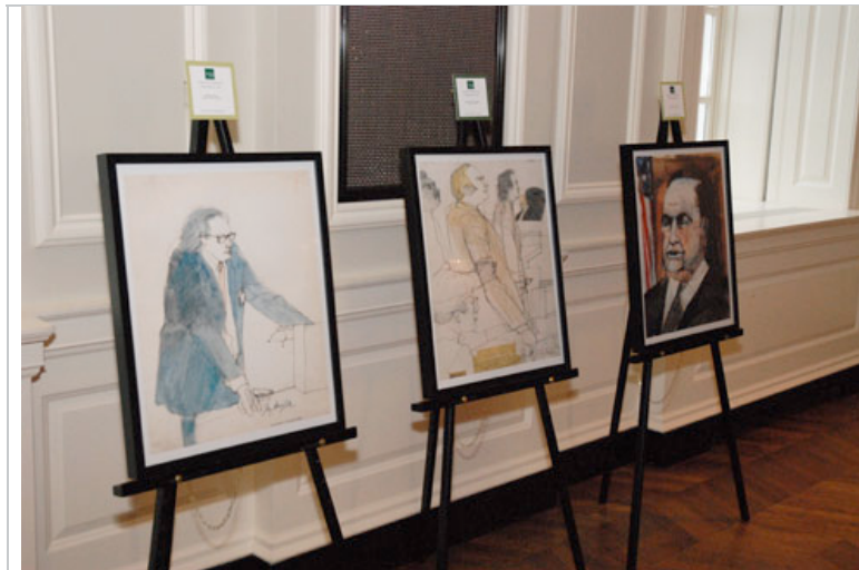
Courtroom sketches drawn by artist Franklin McMahon during the Chicago Seven conspiracy trial served as the event's focal point.